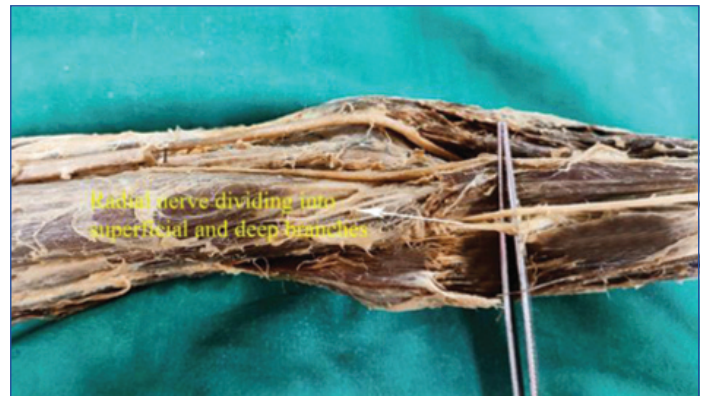
[Table/Fig-6]: Radial nerve dividing into superficial and deep branches in proximal forearm.