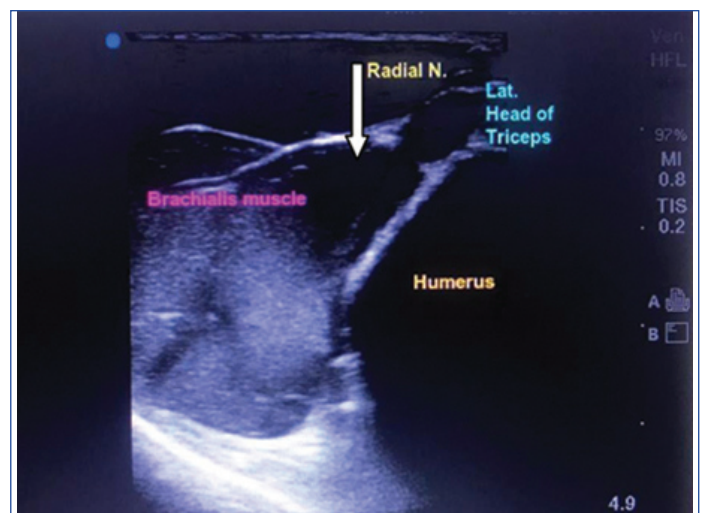
[Table/Fig-7b]: USG localisation of Radial nerve where it pierces the Lateral Intermuscular Septum (LIS).