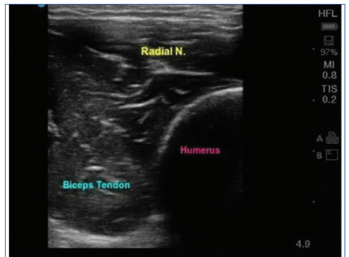
[Table/Fig-7a]: USG localisation of Radial nerve at the elbow.